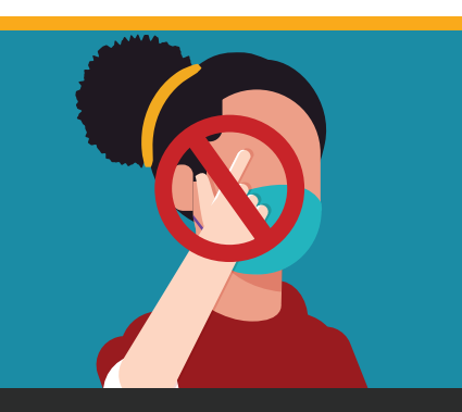
Do not touch your eyes, nose, and mouth.