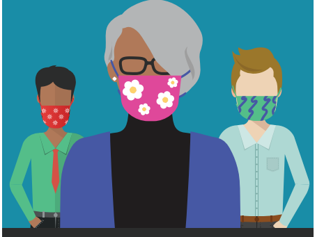
When in public, wear a cloth face covering over your nose and mouth.